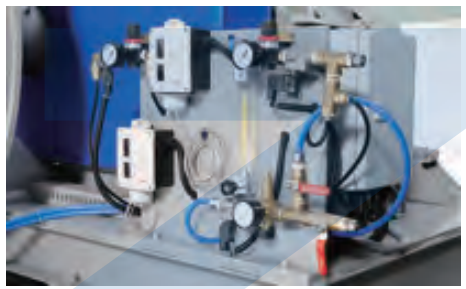
The material temperature is monitored in the process, an automated cooling system will ensure the temperature is kept at a defined level.