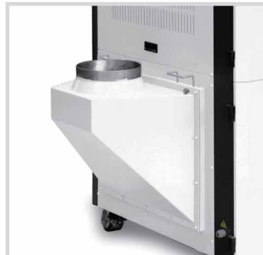
Return Air Cover (Option)