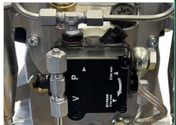
NEW - Adjustable oil pump with oil sieve